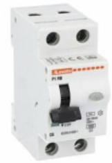
Residual current circuit breaker with overcurrent protection (RCBO) P1 RB 1P+N 2 IEC