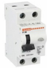
Residual current circuit breaker with overcurrent protection (RCBO) P1 RB 1P+N 2 IEC