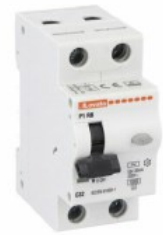
Residual current circuit breaker with overcurrent protection (RCBO) P1 RB 1P+N 2 IEC