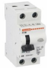
Residual current circuit breaker with overcurrent protection (RCBO) P1 RB 1P+N 2 IEC