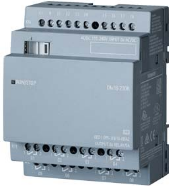
LOGO! DM16 230R expansion module, PS/I/O: 230V/230V/relay, 4 MW, 8 DI/8 DO for LOGO! 8